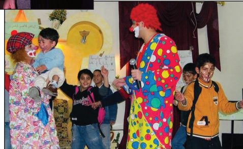
Al-Quds Charitable Society organises classes and activities for children.

The people of Shu'fat need your support and solidarity