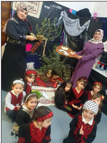
Traditional Palestinian cuisine and handicrafts are passed on to the next generation.

The residents of Shu'fat value education highly and community-based organisations run all kinds of social, educational and health projects. These include vocational training for young people and the disabled and summer camps for the children.