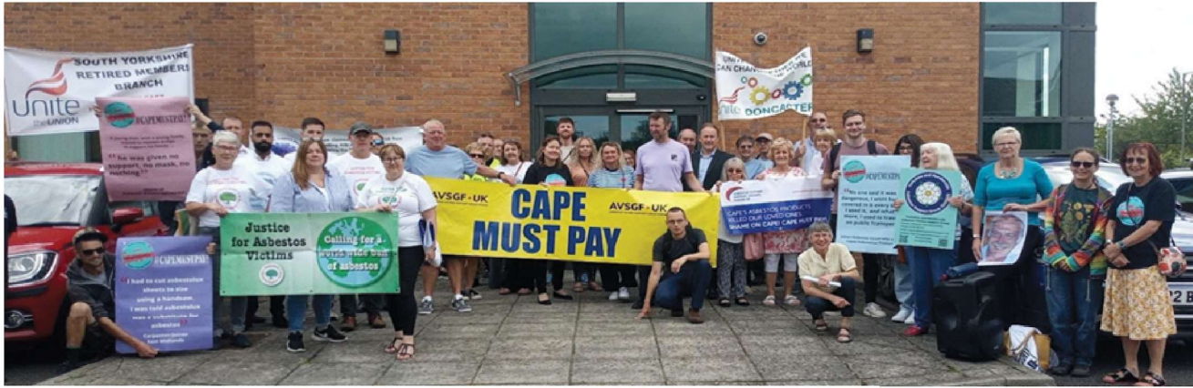
Photo taken alongside Unite's South Yorkshire retired members branch during the 'Cape Must Pay Campaign'. The campaign demands that the Cape Corporation should pay towards the cost of achieving justice for the victims. More on the campaign here: www.asbestosforum.org.uk/cape-case/