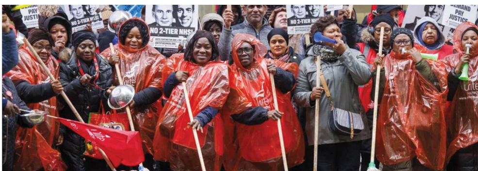
Unite members protesting at the Department for Health, 21 Feb, demanding their missing COVID payments.