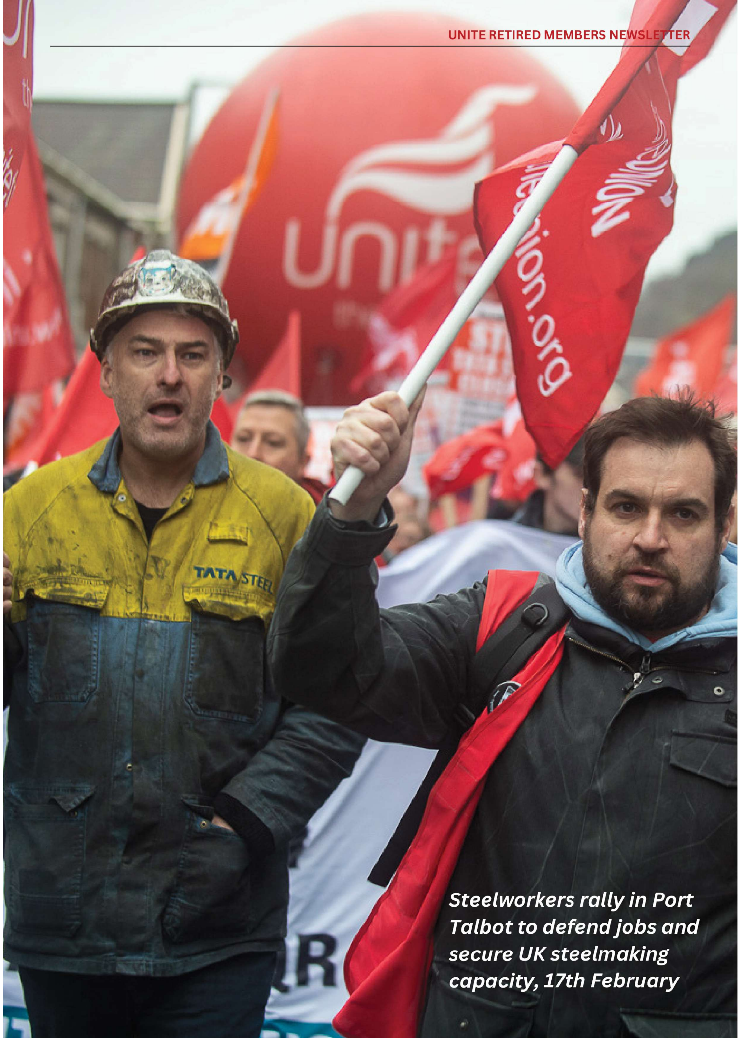
Steelworkers rally in Port Talbot to defend jobs and secure UK steelmaking capacity, 17th February