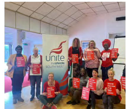
Our South West Women's committee at a development weekend

Contact your Regional Women's and Equality Officer for more information https://www.unitetheunion.org/what-we-do/equalities/contact-us .