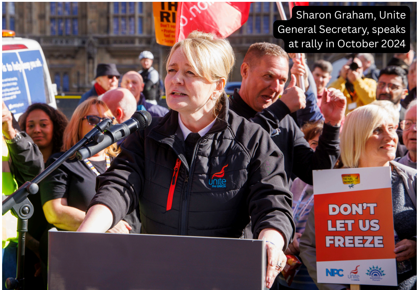
Sharon Graham, Unite General Secretary, speaks at rally in October 2024