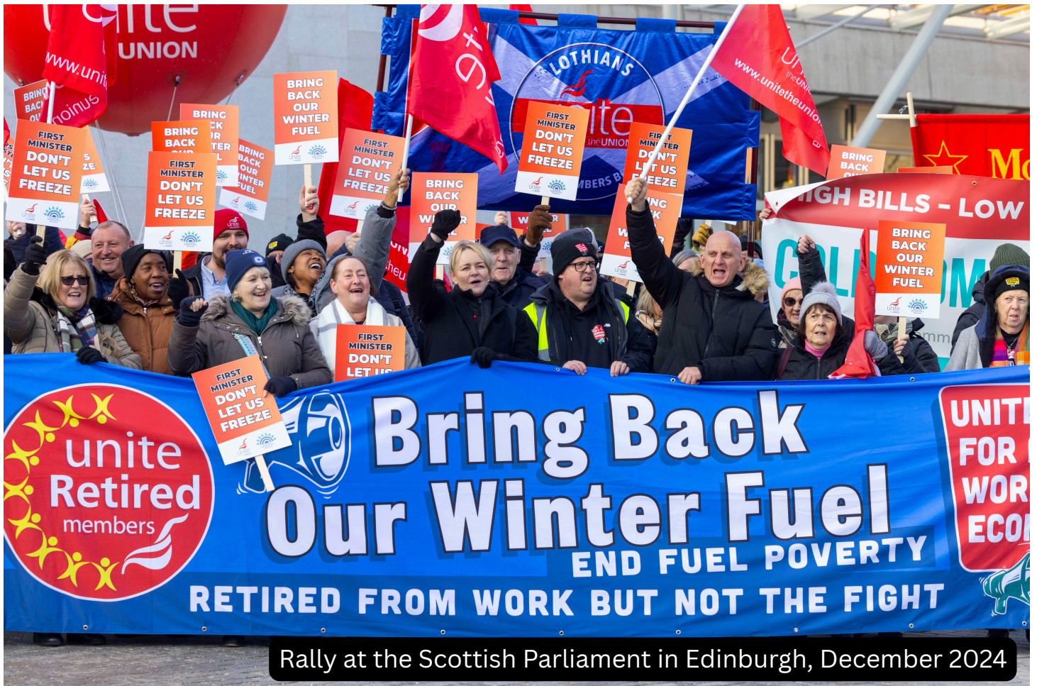
Rally at the Scottish Parliament in Edinburgh, December 2024