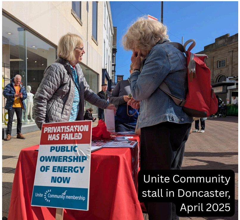
Unite Community stall in Doncaster, April 2025

What's the difference between the UK and France? The UK has a wholly privatised energy system which suffers from endemic